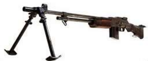
Figure 8. Lightning machine gun "Browning"

The development of firearms is inextricably linked with the name of Fyodor Vasilevich Tokarev. His design career began with the automatic reworking of S.I. Mosin's three-barreled rifle, which was presented for testing in 1910. The indifference of the tsarist government to equipping the army with automatic weapons led to the fact that F.V Tokarev's rifle did not get a ticket to life. After the Great October Socialist Revolution, F.V Tokarev devoted all his talent and knowledge to the creation of new models of automatic weapons. Working at