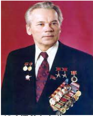
Figure 19. MT Kalashnikov