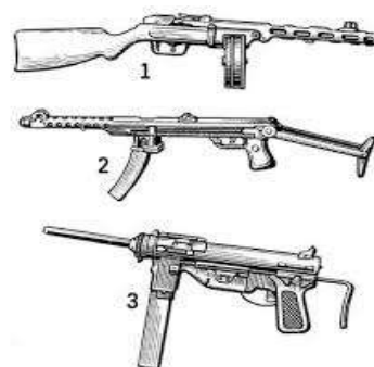
Figure 14. PPSH machine gun

Georgi Semenovich Shpagin worked in an arms workshop during the First World War, and in 1920 joined the project bureau, where famous gunmen VG Fyodorov and V.A Degtyaryov worked. In 1938, together with V.A Degtyaryov, DSHK (developed the mechanism of falling) created a large-caliber machine gun. In December 1940, G.S. Shpagin was recruited to be armed under the name “Shpagin submachine gun” (PPSH). The machine gun was very simple in its operation, it was a mobile weapon of our soldiers during the Great Patriotic War.