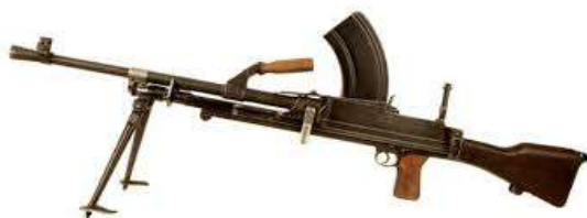
Figure 7. Light machine gun "Bren"