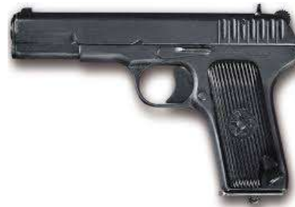
Figure 10. TT pistol

In 1938, F.V. Tokarev completed the development of a self-propelled rifle. The rifle was tested in combat during the Soviet-Finnish war. After being modernized in 1940, this rifle is considered a sniper. In the same year he was awarded the USSR State Prize, the title of Hero of Socialist Labor. During his long and fruitful life, Fyodor Vasilevich created about one hundred and fifty weapons for the army.