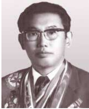
Figure 25. E.L. Khaydurov Figure