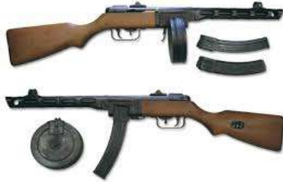
Figure 11. PPSH machine

In 1938, F.V. Tokarev completed the development of a self-propelled rifle. The rifle was tested in combat during the Soviet-Finnish war. After being modernized in 1940, this rifle is considered a sniper. In the same year he was awarded the USSR State Prize, the title of Hero of Socialist Labor. During his long and fruitful life, Fyodor Vasilevich created about one hundred and fifty weapons for the army.