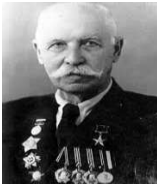
Figure 9. F.V. Tokarev

the Tula weapons factory, he created the Maxim-Tokarev (M-T) handgun, adopted in May 1925. He focused on creating personal weapons for the army command. Thus, in 1930, a self-propelled gun called the Tula-Tokarev (TT) was adopted for armament.