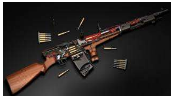
Figure 4. Submachine gun