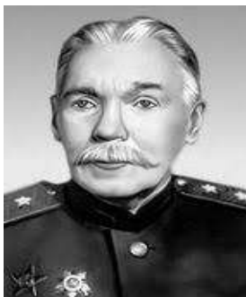
Figure 3. V.G. Fyodorov

The founder of the Russian School of Automatic Weapons was Vladimir Grigorevich Fyodorov. In 1906, he invented his first automatic weapon, which was manufactured, tested and awarded in 1912, but was not accepted for armament.