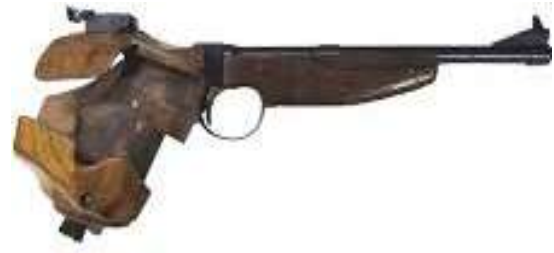
Figure26. TOZ-35 sports pistol

The team of Tula Armament and Izhevsk Machine-Building and Mechanical Plant, which made an invaluable contribution to the development of combat and sports weapons, made an invaluable contribution. In a short period of time at the Izhevsk Machine-Building Plant developed a series of sports weapons "SSV-47", "SV-50", "MSV-5", "S-49" and the designers who worked on its invention: I.A.Samoylov, E.F.Dragunov, V.N.Tushin, A.E Ozerov .In 1955-1965, Izhevsk designers introduced new models of original sports weapons, different types of cartridges, free-range weapons "Zenith", "Strela", "Taiga", small-caliber "SM-1", "SM-2". sports rifles "Running deer", "Running ohu", "Running pig".