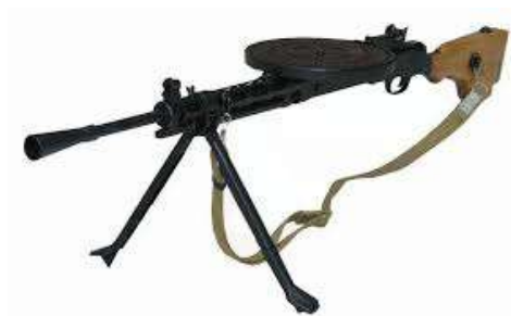
Figure 6. DP machines

In his fighting qualities, he was far superior to the same class of machine guns armed with foreign troops at the time. In 1944, the DP machine gun was modernized. In 1946, V.A. Degtyaryov (RPD-46) created a handgun (RP-1943), which was adopted as the main automatic weapon of the rifle unit.