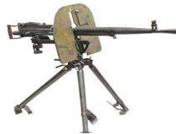
Figure 12. DSHK large caliber machine gun