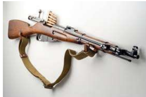
Figure 1. S.I. Mosin Figure 2. A multi-shot weapon

In tests conducted by the Ministry of Defense, 118 foreign brands were also displayed along with Mosin. Only two weapons were tested - the designs of S.I. Mosin and the Belgian gunman Nagan. Although Nagan was able to copy many details of Mosin's rifle, his invention failed to withstand long-term tests.