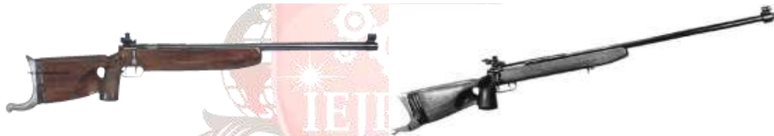
Figure 27. Strela sports weapon 1.

The team of Tula Armament and Izhevsk Machine-Building and Mechanical Plant, which made an invaluable contribution to the development of combat and sports weapons, made an invaluable contribution. In a short period of time at the Izhevsk Machine-Building Plant developed a series of sports weapons "SSV-47", "SV-50", "MSV-5", "S-49" and the designers who worked on its invention: I.A.Samoylov, E.F.Dragunov, V.N.Tushin, A.E Ozerov .In 1955-1965, Izhevsk designers introduced new models of original sports weapons, different types of cartridges, free-range weapons "Zenith", "Strela", "Taiga", small-caliber "SM-1", "SM-2". sports rifles "Running deer", "Running ohu", "Running pig".