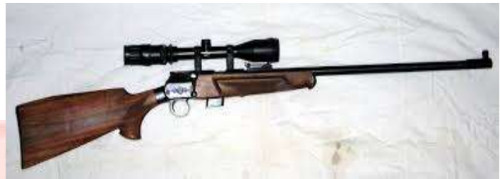
Figure 22. Small caliber rifle TOZ-8

Dmitry Mikhailovich Kochetov, considered the inventor of the Soviet small-caliber sports weapon, invented the TOZ-8 and TOZ-12 series of small-caliber rifles.