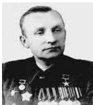
Figure 13. G.S. Shpagin