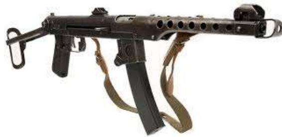
Figure 16. PPS machines

Famous weapons designer Alexei Ivanovich Sudaev. In 1942, he created a weapon that was significantly different from all the automatic weapons available at the time. The presence of a pistol holder made it possible to hit a very precise target when the cannon was assembled in case of need, which was of great importance in a sudden collision with the enemy. On the Leningrad front and in 1943 machine guns were adopted.