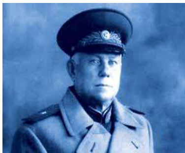
Figure 5. V.A. Degtyaryov

Vasily Alekseevich Degtyaryov made a significant contribution to the development of automatic weapons. On behalf of M.V. Frunze, he began developing the handgun, which was introduced for testing in 1924. After correcting some shortcomings, in 1927 the machine gun was adopted by the Red Army and renamed the Degtyaryov Infantry.