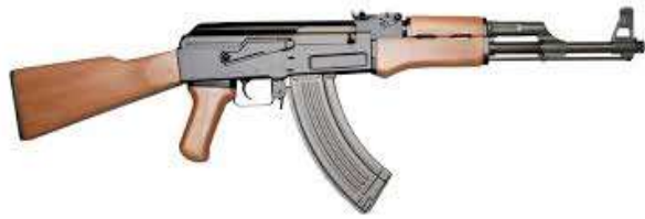
Figure 20. 7.62 mm caliber pistol (AK)

He was awarded the title of Hero of Socialist Labor for his services to the construction industry in the field of armaments.