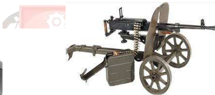
Figure 18. SG-43 machine gun

During the Great Patriotic War, under his leadership, a group of designers created on the design machine V.A Degtaryov's "Goryunov's machine gun 1943" (SG-43). According to some tactical and technical data, the new machine gun has surpassed the machine gun of the "Maxim" system.