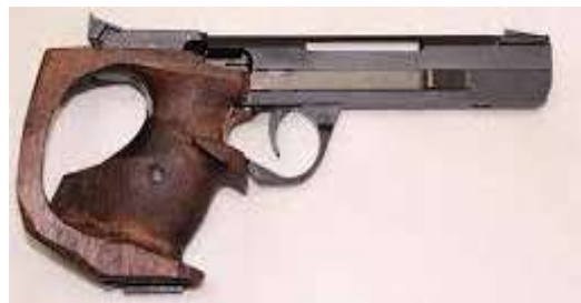
24. The frame of PK Sheptarsky

Sports pistols TOZ-35, XR-64 (Khaydurov-Razoryonov-64), XR-31 and TOZ-36 revolver series were invented not only by the designer Efimov Leontyevich Khaidurov, who is famous in our country and abroad for sports weapons.