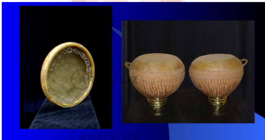
Figure 3: Percussion percussion instruments

Darwish Ali gave information about the musical ensembles that existed in his time (XVII acp) and their performers. The palace had an ensemble of 60 musicians. The ensemble of 60 musicians, known as the Drum Room, was led by a drummer. Darwish Ali gives the following evidence as an example: