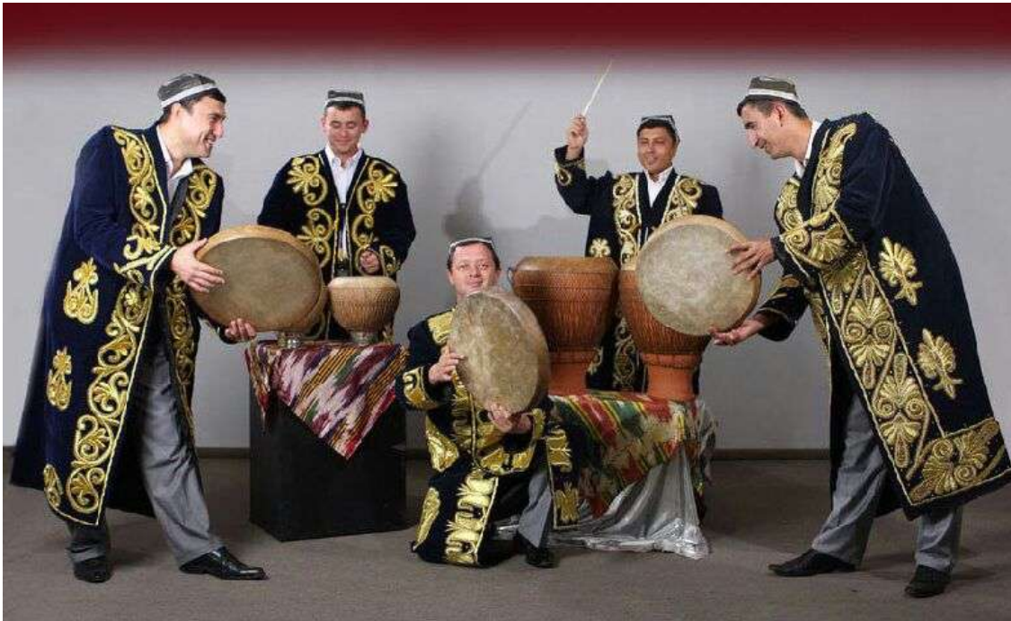
Figure 4: Circles.