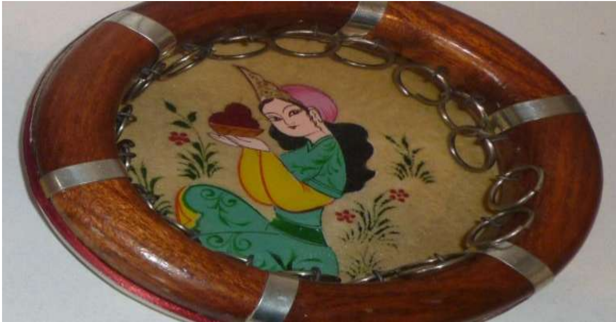
Figure 2: Miniature circle.

Darwish Ali gave information about the musical ensembles that existed in his time (XVII acp) and their performers. The palace had an ensemble of 60 musicians. The ensemble of 60 musicians, known as the Drum Room, was led by a drummer. Darwish Ali gives the following evidence as an example: