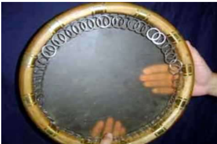
5 - picture; The structure of the circle.