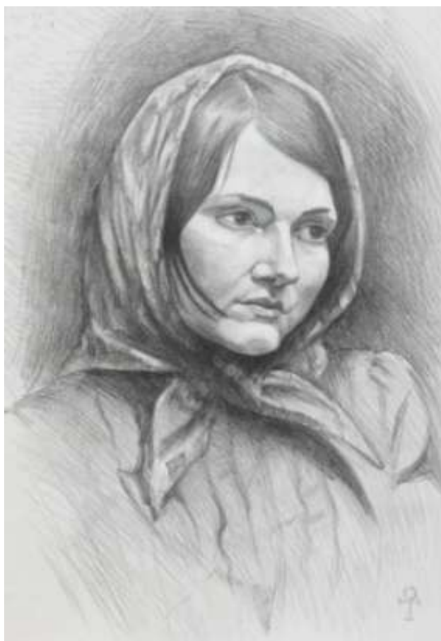
Portrait of a woman