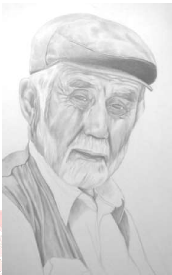
Portrait of an old man

Mastering the methodological sequence of depiction allows the novice artist to work confidently, knowing how each stage is solved individually, without interruption. A young artist with practical experience in painting begins with a child who has the ability to anticipate the end result.