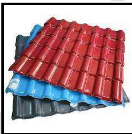
Fig-3: Roofing Sheets

Corrugated plastic boards are essentially plastic cardboard, and are made from three layers of thin, polypropylene plastic substrate. The product consists of a zigzagged layer of plastic sandwiched between two smooth layers of plastic sheeting – also known as twin-wall plastic sheeting.