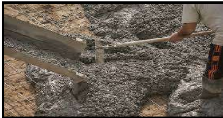
Fig-14: Concrete with plastic mix

Recycled plastics can be used to make stronger concrete structures in the form of sidewalks, driveways and more. Students at IIT have recently conducted experiments with recycled plastic by exposing small amounts of it to gamma radiation, mixing it into a powder and then mixing that into cement paste.