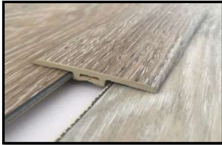
Fig-6: Lamination Mould Placement

As the name implies, decorative film laminates are plastic films made of multiple layers, laminated together to provide various types of decoration – from wood grain to chrome appearances. Sometimes called “foils,” the various materials carry the same basic makeup: a cap, or clear layer, decorative layers, and a substrate layer.