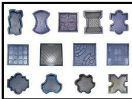
Fig-11: Plastic Paver Blocks

Plastic is used to manufacture the paver blocks to reduce their cost as well as to reuse the waste generated by the plastic in the environment. The use of plastic material in the paving blocks reduces the cost of the block as well as improves the quantity and by manufacturing these blocks waste management can be achieved. In most of the cities in India this experiment of the paver blocks is taking place.