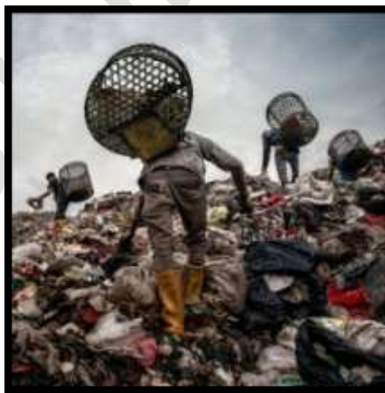
Fig-1: Plastic Waste