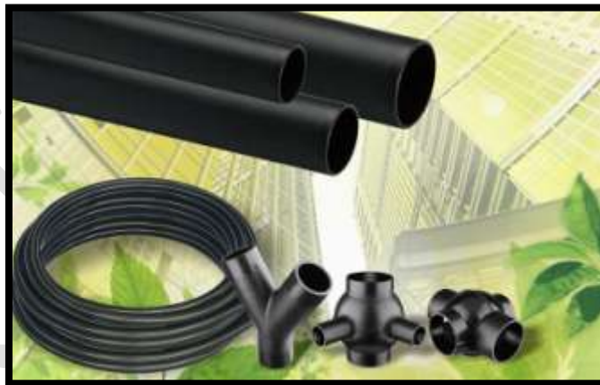
Fig-10: HDPE pipes

LDPE pipes can carry cables and water. Irrigation and agricultural applications commonly use LDPE pipes.