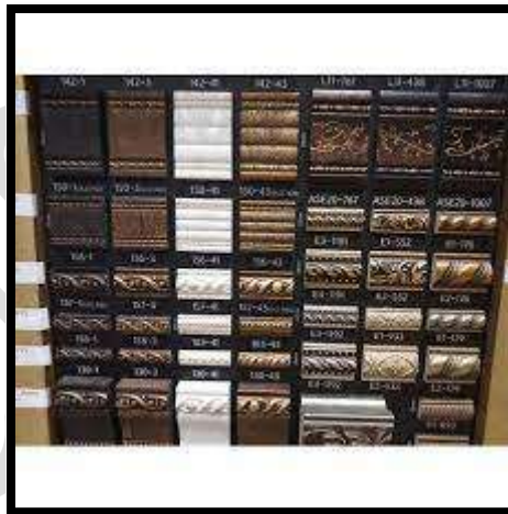
Fig-7: Decorative Laminations

Decorative film laminates are often used in the creation of large pressure-sensitive decals. In this case, the substrate layer is replaced with a pressure-sensitive adhesive and backing. Decals are precision trimmed from the flat laminate, the backing is removed and the decal is applied to an existing component. Pressure is imparted during the application, activating the adhesive system. Common uses include automotive striping and “blackouts” such as b-pillars.