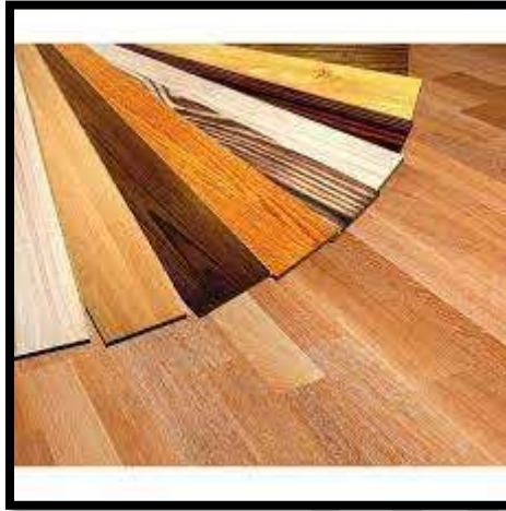
Fig-4: PVC Flooring

which is available in standard tile sizes. Flexible PVC flooring is suitable for comparatively lighter traffic, either for rigid floors such as concrete and stone flooring or for flexible floors such as timber flooring, etc. PVC products are fire retardant. This is because they contain more than 70 % PVC which turns 57% Chlorine. This contributes efficiently to the flame retardant. Further, it has very high ignition temperature 400°C against 210°C of wood and has an index of 50% against 21% for wood.