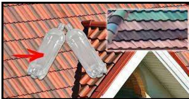
Fig -2: Roofing Tiles

Corrugated plastic boards are essentially plastic cardboard, and are made from three layers of thin, polypropylene plastic substrate. The product consists of a zigzagged layer of plastic sandwiched between two smooth layers of plastic sheeting – also known as twin-wall plastic sheeting.