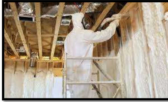
Fig-9: Indoor Insulation

Various insulation companies have begun developing insulation with recycled plastic inside of it because only a minimum amount of plastic will maximize your home’s energy efficiency levels.