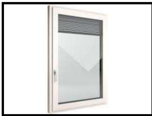
Fig -8: PVC window

PVC windows have grown in popularity because they are easy to design and can adapt to many varying styles. A bonus is that because they are made primarily from plastics, the frames are 100% recyclable.