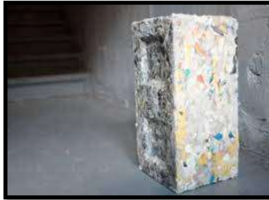
Fig-13: Plastic Brick

Recycled bricks can be put together in a LEGO-like way, making a home’s building time much quicker than it would be with traditional brick.