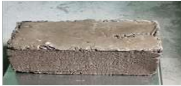
1) Fig-1: Plastic Brick Removing it from Mould