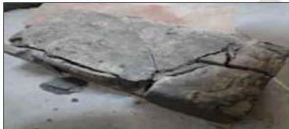
Fig-2: Brick after the compressive strength test, failure due to compressive load