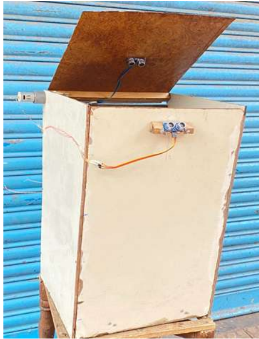
Fig.11 Prototype model.