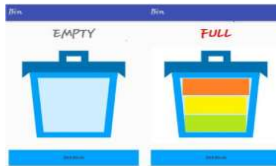
Fig.12 Result of system