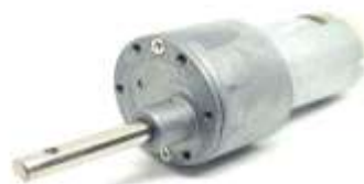
Fig.7 12V DC Geared Motor 27kgcm 100rpm