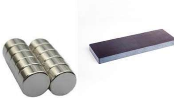
Figure 5: Types of magnet

Ideally the magnet width should be equal to or greater than the coil core. Rectangular magnets give an improved performance over simple discs in order for the magnet field to sweep across the entire face of the coil or close to it[9]. The distance between each magnet cannot less than 1.5 to 2 size of magnet widths. This is because to avoid interactivity of the scalar south poles.