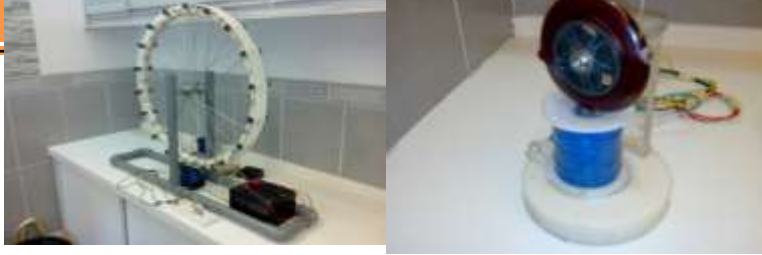
Figure 1: Bedini SSG based on original design Figure 2: Bedini SSG replication design

Figure 1 and figure 2 show the Bedini SSG based on original design and the replication design respectively. Meanwhile, figure 3 explains the methodology and procedure in developing the original Bedini Monopole Mechanical Oscillator SSG Energizer and 4-Pole Neodymium Magnet Bedini SSG Replication. Both SSG will be tested to compare their performance in terms of COP.