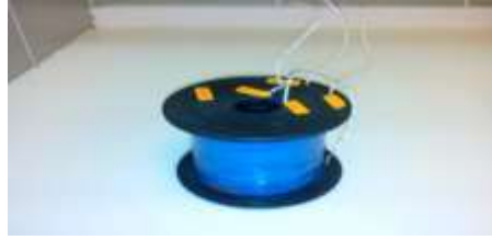
Figure 4: Bifilar Coil for Bedini SSG