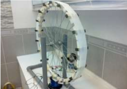
Figure 7: prototype of original Bedini SSG rotor

It is worth noted that anything round and non-magnetic can be used as a rotor[10]. For example, skate board wheels, with a little grinding or machining of the rubber to accommodate the magnets can make a good 3 or 4 pole rotors. Basically smaller diameter, 3 or 4 pole rotors run at higher RPM and draw less current like 6 pole rotor. This may be an important consideration in keeping the current draw down, below the critical battery C20 rate, on the smaller batteries[11]. In addition, it is a wise precaution to wrap some kind of heavy duty strapping tape with the little strings imbedded in it, or even electrical tape around the perimeter of the rotor as a back-up to gluing of the magnetsin.