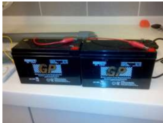
Figure 8: Sealed lead acid battery

In this project, the charging process is usually stopped after a voltage is reached at certain amount[13]. It is recommended to rest the battery a minimum of one hour before charging or discharging. However, in the short term it is fine to cycle the battery without a rest period. Normally, Lead-acid batteries are rated for a 20-hour discharge. The current that will discharge the battery from fully charged is about 13.8 volts to fully discharge around 11.5 volts in 20 hours is called the C20 rate [9].