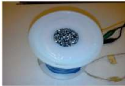
Figure 6: Coil Core

The coil core is metal rod that stuffed in the middle of the coil winding. Normally, it stuffed with welding rod. Other materials can also be used provided the rod compatible to react with the magnet. If the materials retain any magnetism when the magnet is taken away, then they are not suitable. If both south and north attract to both core ends, then such core issuitable.