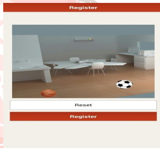
Fig 3.5 shows object movement as a password.

In above we see complete first module which is having totally registration. Now we see another module that is for login for shoulder surfing safe graphical watchword plans in which circle having eight sector with different eight colour in which it having 26 alphabet with capital letters, 26 alphabet with small letters, 1 to 9 numbers and two symbol i.e @ and # as shown in below fig. 3.6 login page. In which it contain three buttons left, right, and back. Left and Right for rotating circle in which we choose our color in registration form for selecting password either left or right. And back for delete wrong alphabet which chosen by user. Then click on login for entering into another module that is nothing but login for 3D image which is not design yet.