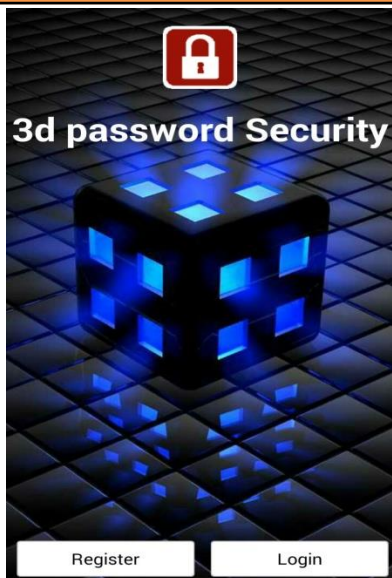
fig. 3.2.Home page

After click on register of fig 3.2 new page open in which all general information will be ask as well as one colour also ask for selecting at the time of login which we need.