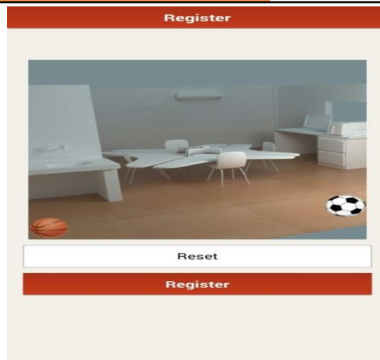
Fig 3.4 shows 3D environment as a second level

And after clicking on register of fig 3.3, 4 to 5 theme will be appear from which user can select any one 3D environment as a second level in which we do some object movement and some tab as a password. Fig 3.4 shows 3D environment as a second level & Fig 3.5 shows object movement as a password.