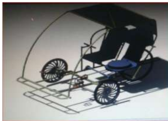
Fig.2 Hybrid Tricycle

Rear suspension increases ride comfort and reduces the effect of the bump